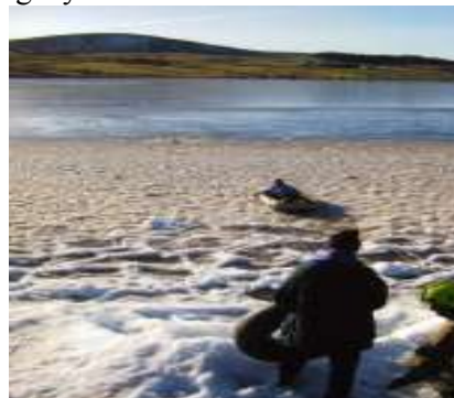
Makeshift Rescue Equipment

A dog had a very lucky escape recently when it fell through ice at Threipmuir. It was rescued in the nick of time by the owner using a child's inflatable with the rescuer and inflatable roped to firemen at the water's edge. It could easily have been a tragedy. Never venture onto ice!