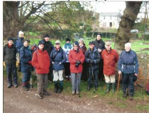
Walkers at Swanston Cottage

The circular walk from Swanston on 3 December with tales of Henry Cockburn and RLS, which was cancelled twice last year due to weather, was enjoyed by 20 walkers despite the cold. Starting with bacon rolls at Swanston proved popular!