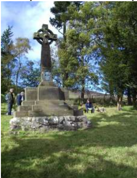
The Fraser Tytler Memorial

The sale of our 2012 calendar has been well received and raised over £2,000. We have recently received a reprint of the Pan-Pentland map and an A5 leaflet about the former mansion at Woodhouselee and the Fraser Tytler Memorial. If you would like a copy of the latter please contact the Secretary.