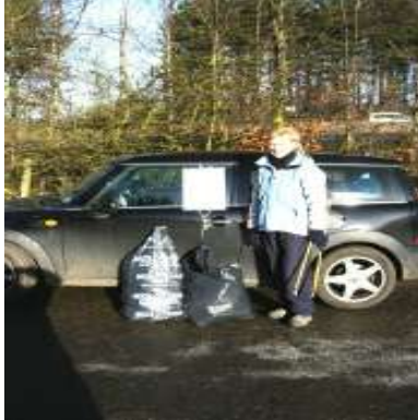
Litter Picking HQ at Dreghorn

The first litter picking session of the year was abandoned due to the January storm. However, six litter pickers collected an amazing 18 bags of rubbish at Dreghorn on a bright, if cold, morning in early February.