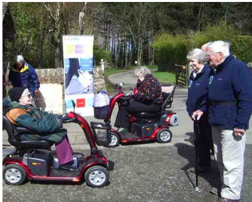
ready for the off