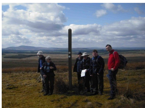
ready to tackle the inspection

Over the years we've installed or helped to install a number of items of 'country furniture' as they're known i.e. stiles, sleeper bridges, way marking posts and line of sight posts etc.