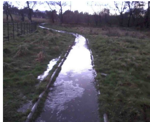
before and after

Following discussion with the Rangers it was decided that the answer would be to create some culverts to allow for better drainage and to raise the path. We were fortunate to receive a very kind donation of 6 tonnes of aggregate from the Tarmac Group based at Ravelrig Quarry.